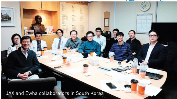
JAX and Ewha collaborators in South Korea

“ Our study has revealed two potential novel molecular mechanisms for the treatment of subsets of gastric cancers. Moreover, our approach of integrating genomic molecular profiling and PDX mouse models provides a valuable platform for novel drug-target discovery and validation. ” – Charles Lee